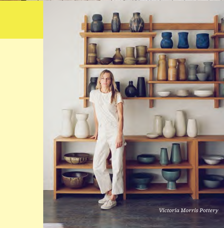
Victoria Morris Pottery