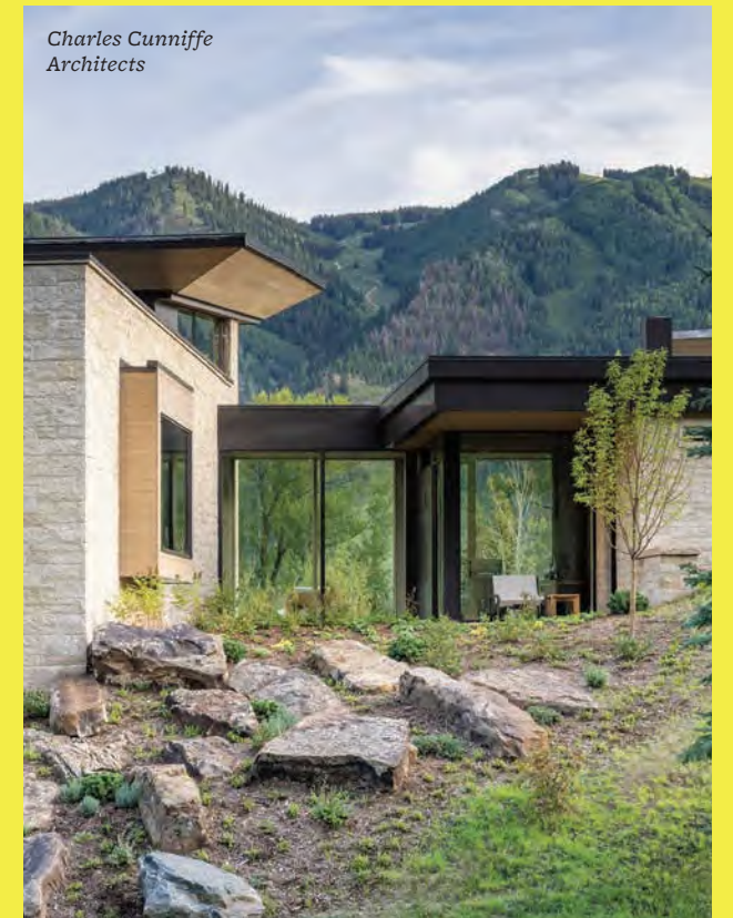
Charles Cunniffe Architects