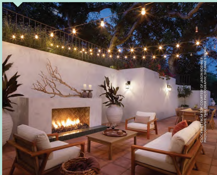
CLOCKWISE FROM TOP: COURTESY OF JASON ROEHRER; PHOTOGRAPHS: PAUL DYER PHOTOGRAPHY; SUZANNE STRONG