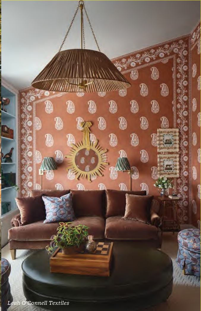
Leah O'Connell Textiles