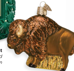
Glass Ornament $20; oldworldchristmas.com