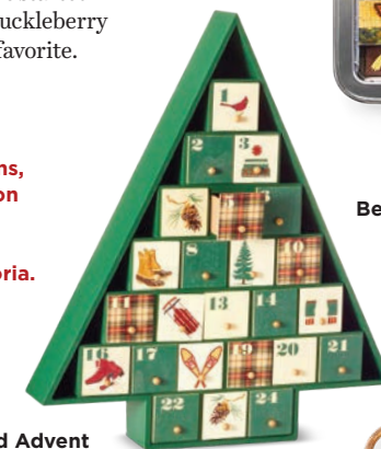
Woodland Advent Calendar $60; llbean.com