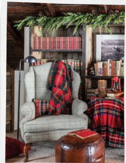
An Edward S. Curtis photograph has a place of prominence between built-ins lined with red-bound books.

Beloved Bookstore: Wheatgrass Books ( wheatgrassbooks.com ) is a cute little bookstore with some great finds, and Sax & Fryer Co. has been around since 1883.