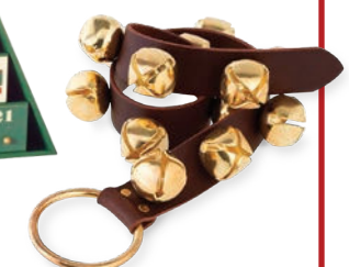
Ohio Travel Sleigh Bells $35; amazon.com