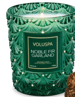
Noble Fir Scented Candle $26; voluspa.com

Eggnog or Mulled Wine: Neither. For us, it's hot chocolate with marshmallows or red wine usually bought at Matt's Old Fashioned Butcher Shop & Deli ( mattsbutchershopndeli.com ).