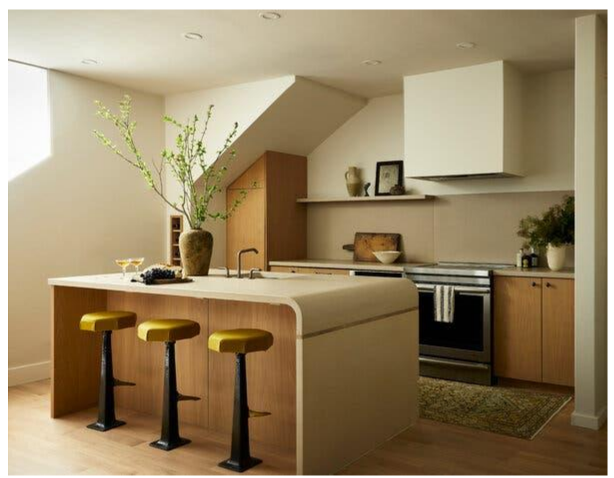
When installing recessed ceiling lights, focus on lighting counters and circulation spaces, as in this kitchen by Moore House Design.