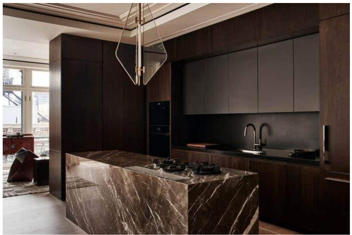
Concealed lighting, including under-cabinet LEDs, allows a single decorative pendant to be the center of attention in a kitchen designed by Workshop/APD.