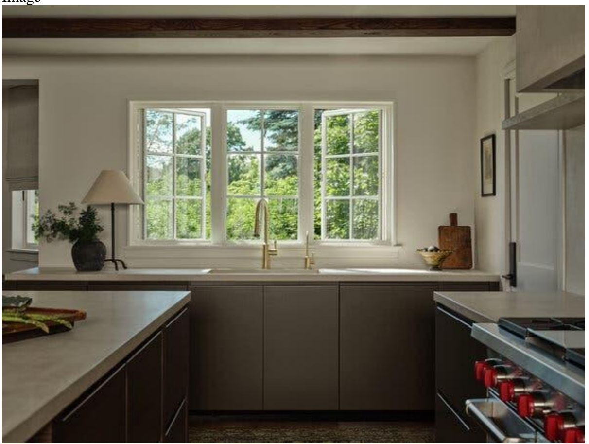
Not all kitchen lighting needs to be built in. Many designers, like Blair Moore of Moore House Design, are now using plug-in table lamps in kitchens.