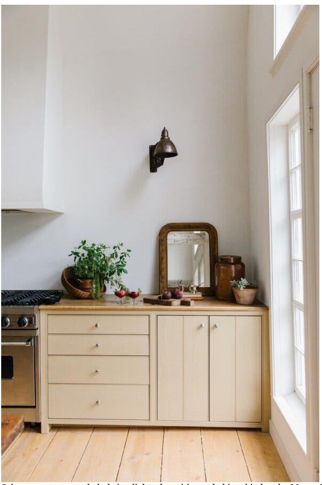
Scissor-arm sconces help bring light where it's needed in a kitchen by Moore House Design.